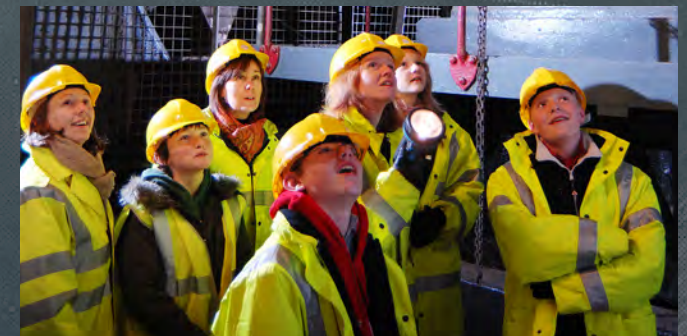
A unique behind the scenes tour.