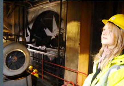
Go behind the scenes of Georges Dock Building, a Grade II listed Art Deco masterpiece.