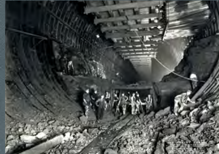
Hear how the tunnel was constructed.

This unique experience is one that you won't easily forget.