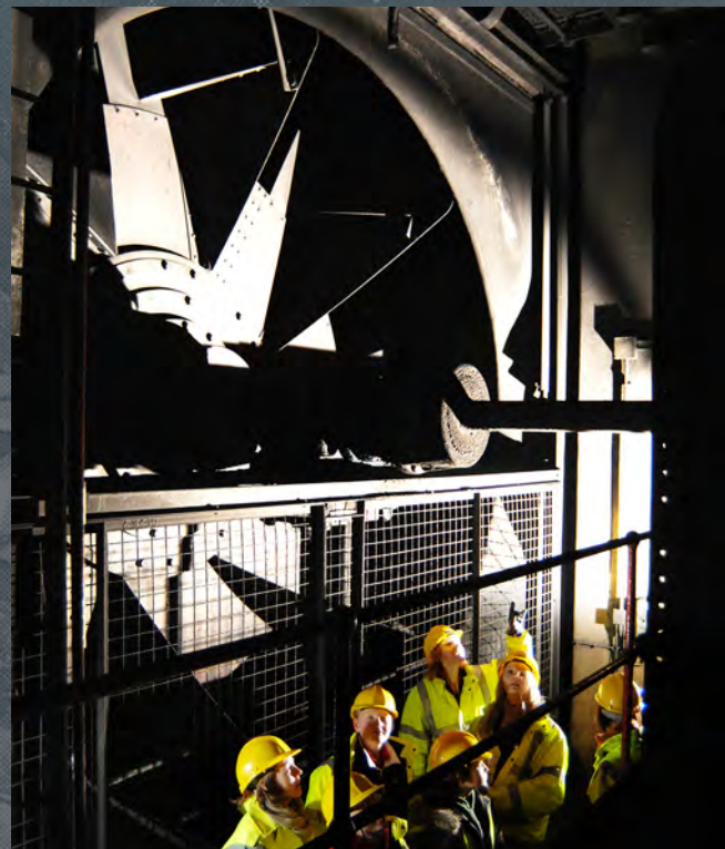
Witness engineering excellence first hand.