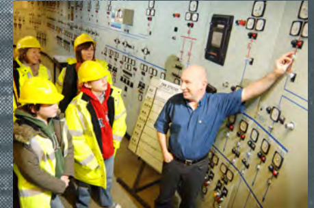
View the original tunnel control room.